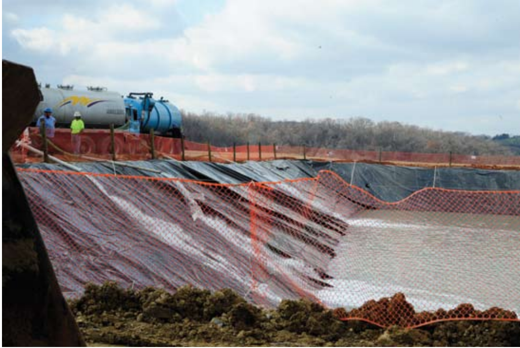
The disposal of fracking wastewater in open pits contributes to air pollution, while leakage from improperly lined pits has contaminated groundwater and surface water. Chemicals present in fracking wastewater have been linked to serious health problems, including cancer.

of the world's largest water filtration plants. New York has already had to take this step for one major source of drinking water, spending $3 billion to build a filtration plant for the part of the watershed east of the Hudson River. 27 The cost of doing the same for areas west of the Hudson, which sit atop the Marcellus Shale formation, was estimated in 2000 to be as much as $6 billion. 28