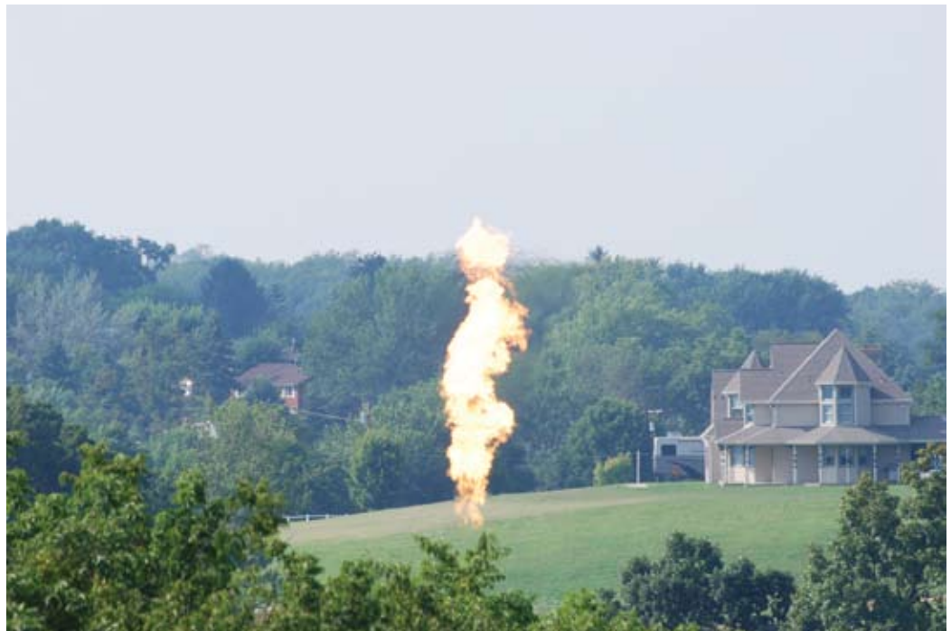
In parts of the country, fracking takes place in close proximity to homes, schools and hospitals, creating the potential for conflict. A Texas study has found that some homes near fracking well sites have lost value. Above, a natural gas flare near homes in Hickory, Pa.

While estimates of the costs of plugging and remediation of fracked wells vary, those costs almost always exceed a state's bonding requirements. Pennsylvania's recently revised bonding requirements, for example, require drillers to post maximum bonds of only $4,000 per well for wells less than 6,000 feet in depth and $10,000 per well for wells deeper than 6,000 feet, creating the potential for the public to be saddled with tens or hundreds of thousands of dollars in liability for plugging and reclamation of abandoned wells whose owners have gone bankrupt or walked away from their responsibilities. 105 The experience of previous resource extraction booms and busts suggests that the full bill for cleaning up orphaned wells may not come due for decades.