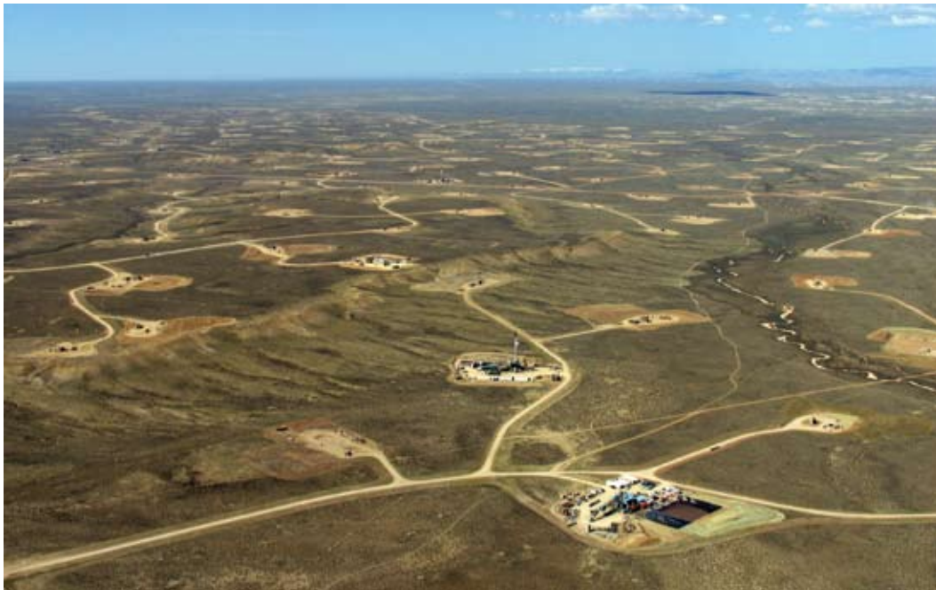
Oil and gas development fragments valuable natural habitat. Above, the Jonah gas field in Wyoming.

Other natural features affected by fracking—including groundwater, rivers and streams, and agricultural land—provide similar natural services. The value of all of those services—and the risk that an ecosystem’s ability to deliver them will be lost—must be considered when tallying the cost of fracking.