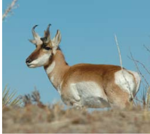
Pronghorn antelope are among the species that have been affected by intense natural gas development in Wyoming.

lution reduction targets designed to restore the bay to health. 69 Based on an estimate of the cost per pound of nitrogen reductions from a recent analysis of potential nutrient trading options in the Chesapeake Bay watershed, 70 the cost of reducing nitrogen pollution elsewhere to compensate for the increase from natural gas development would run to approximately $1.5 million to $4 million per year.