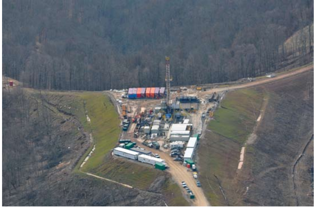
Fracking imposes a range of environmental, health and community impacts. Above, a fracking well site is built in a forested area of Wetzel County, W.Va.

draulic fracturing, to operate that well, and to deliver the gas or oil extracted from that well to market.